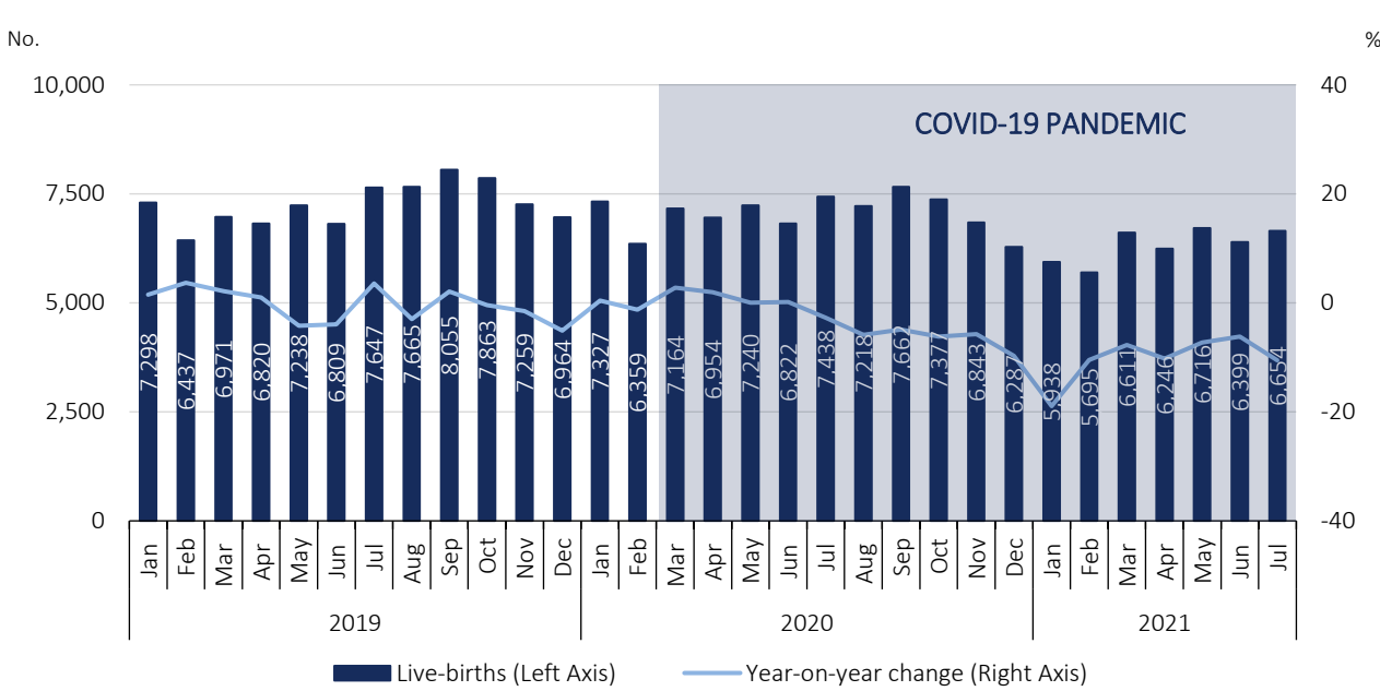
Figure 4: Live births and year-on-year change, January 2019 to July 2021

Despite some recovery in births from March 2021, the number of live births was always lower than between the months of January to July 2020, representing a total of 5,045 less live births.