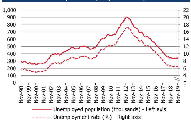
Figure 2: Unemployed population and unemployment rate (seasonally adjusted data)

Note: The November 2019 estimates are provisional.