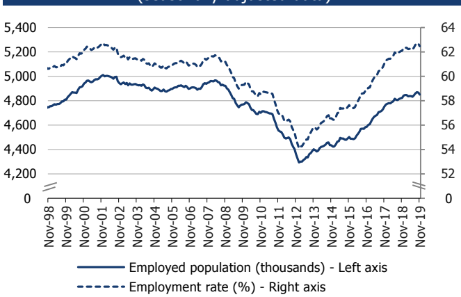
Figure 1: Employed population and employment rate (seasonally adjusted data)

Note: The November 2019 estimates are provisional.